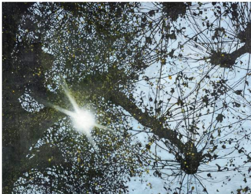
HSU Chang-Yu. Lights in the Forest-1, 2016 Lights in the Forest 1, 2016, 194 x 130 cm, Oil on Canvas

Located in Taipei, Liang Gallery is dedicated to promote worldwide the modern and contemporary Taiwanese art.