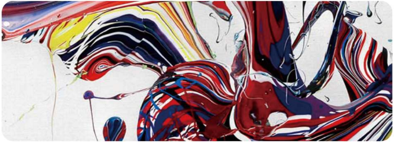
Detail of Katrin Fridriks. Gracious Awakening, 2016. acrylic on canvas 100x100x10cm. Courtesy of Circle Culture. Gallery photo Fridriks workshop

ART16 is back to celebrate its 4th edition at Olympia, bringing together over 100 galleries from more than 30 countries. With a diverse and varied array of more than 1,000 outstanding artworks the fair represents one of London's must-see of the summer season. ART16 runs from 20th to 22nd May 2016.