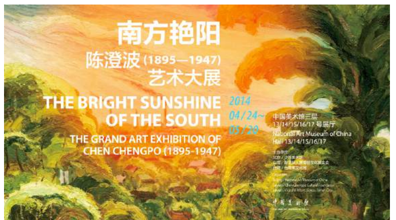
The Bright Sunshine of The South: The Grand Art Exhibition of Chen Chengpo, The National Art Museum of China, 2014