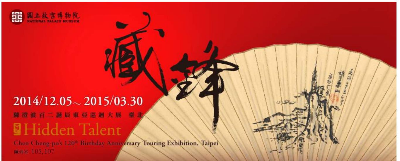
Hidden Talent - Chen Cheng-po's 120 th Birthday Anniversary Touring Exhibition, National Palace Museum, 2014-2015