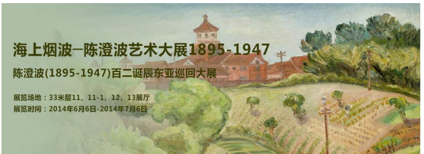
Misty Vapor on the High Seas: Chen Cheng-po's Art Exhibition, China Art Museum, Shanghai, China, 2014