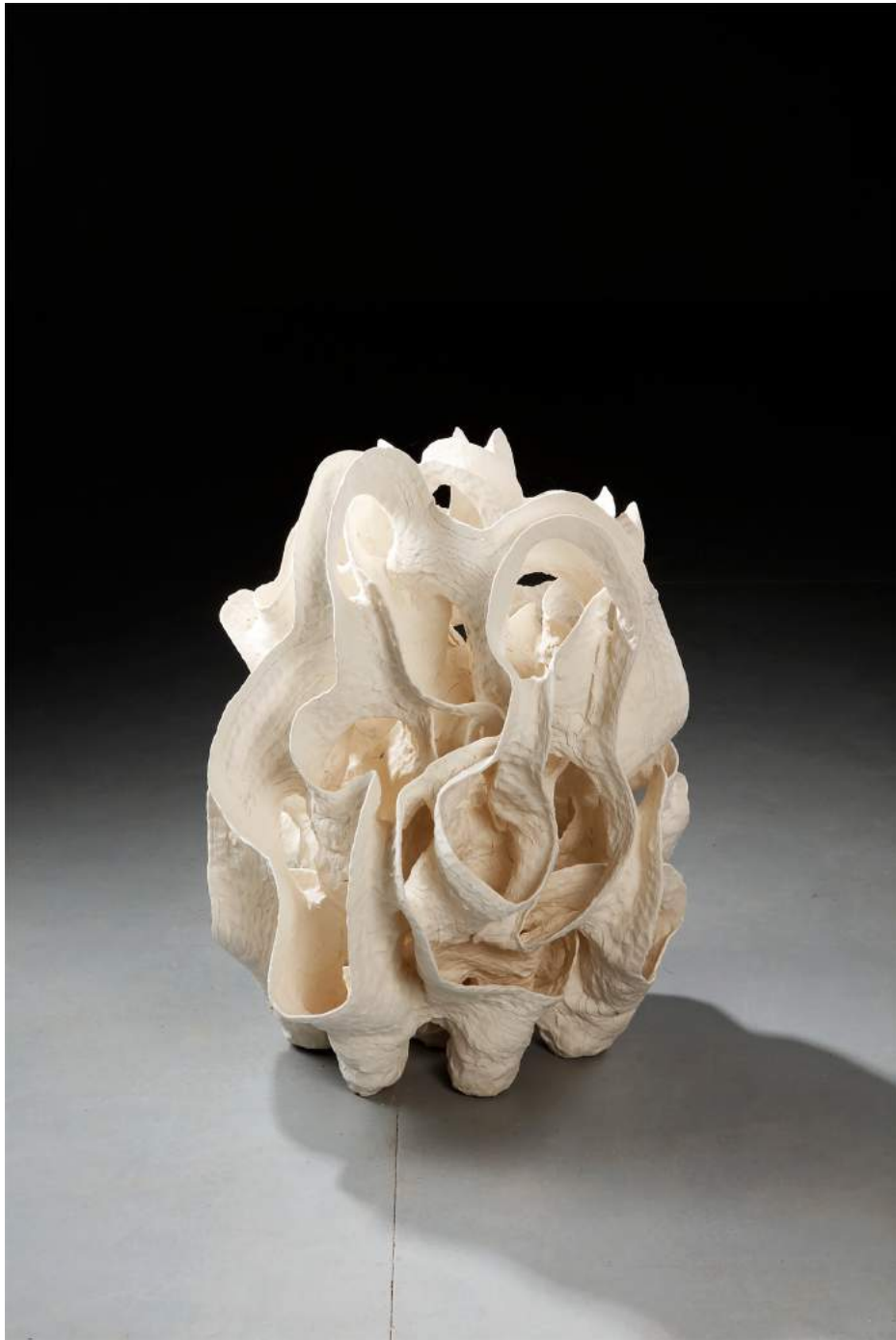
HSU Yunghsu 2017-8, 2017 Porcelain H61×L45×W42cm H78×L60.5×W61cm (stand)