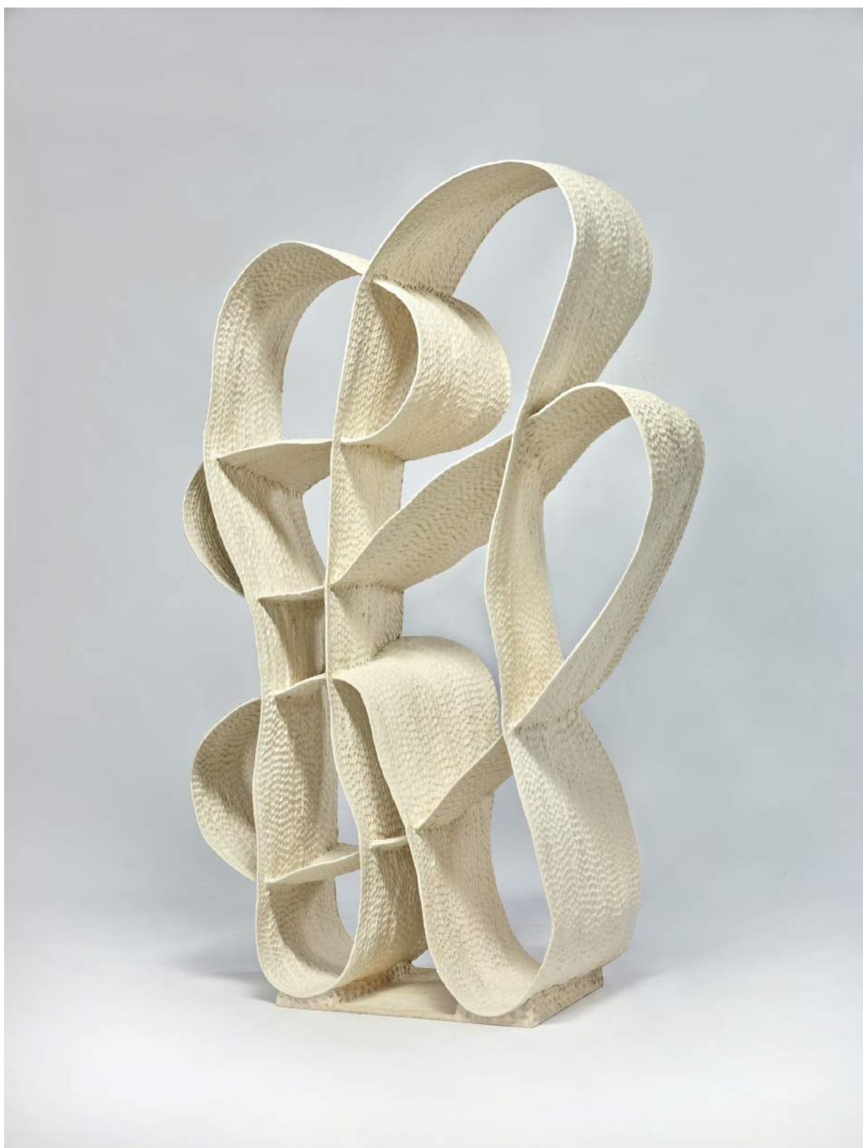
HSU Yung-hsu 2022-15, 2022 Porcelain H177×L105×W45cm