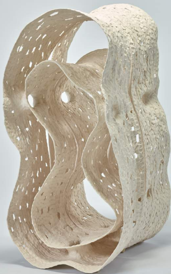
HSU Yunghsu 2021-10, 2021 Stoneware H79×L52×W40cm H80×L60×W60cm (stand) HKD 202,000 USD 25,800