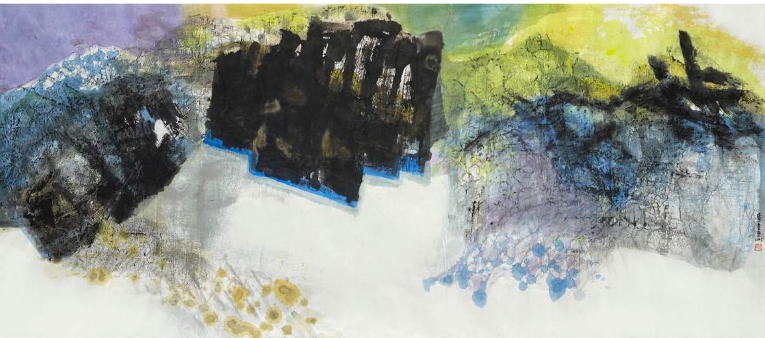
LEE Chung-Chung The River of Life I, 2015 Ink and color on paper 95×216cm 95×216×3cm (with mounting board)