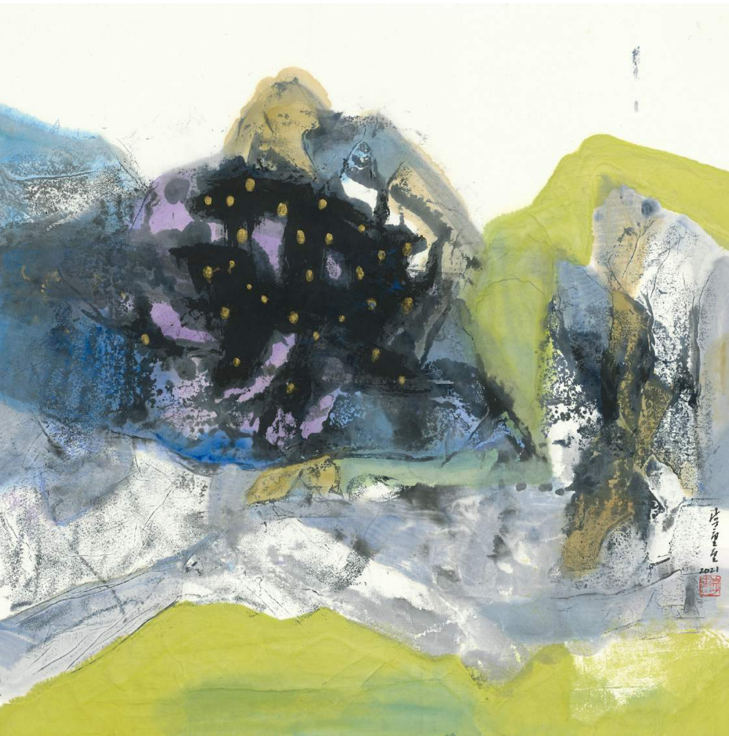
LEE Chung-Chung Back to Nature, 2021 Ink and color on paper 69×68.5cm 90×90×5.5cm (with frame)