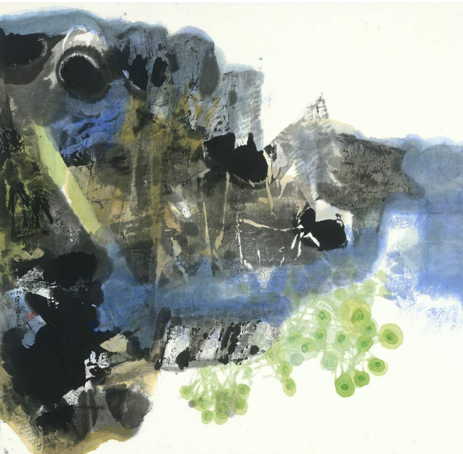
LEE Chung-Chung Breeze and Dew, 2020 Ink and color on paper 69.8X69cm 90.2X90.1X5.5cm (with frame)