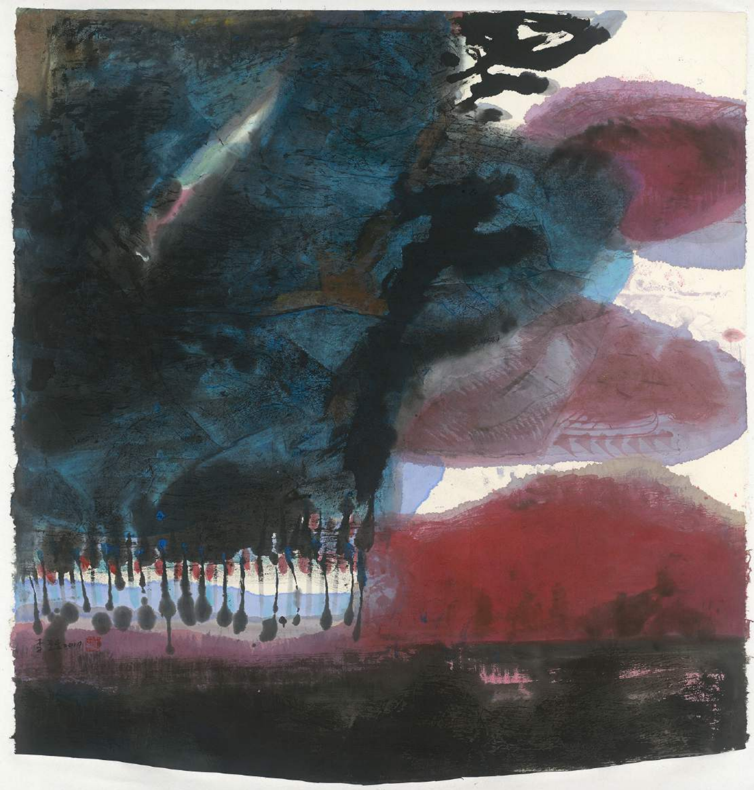
LEE Chung-Chung Tender As Water, 2019 Ink and color on paper 103.1×96.8cm 123.6×121.8×6cm (with frame)