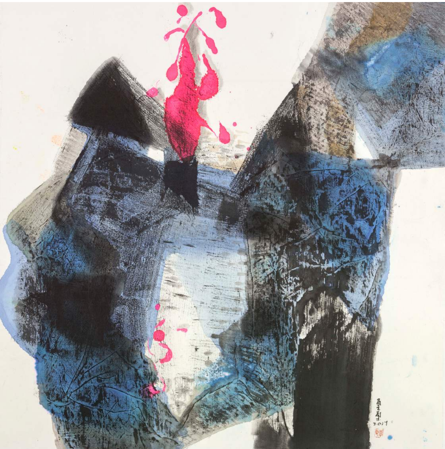
LEE Chung-Chung Through the Lucid Dreams, 2017 Ink and color on paper 69×68cm 90.4×89.5×5.1cm (with frame)