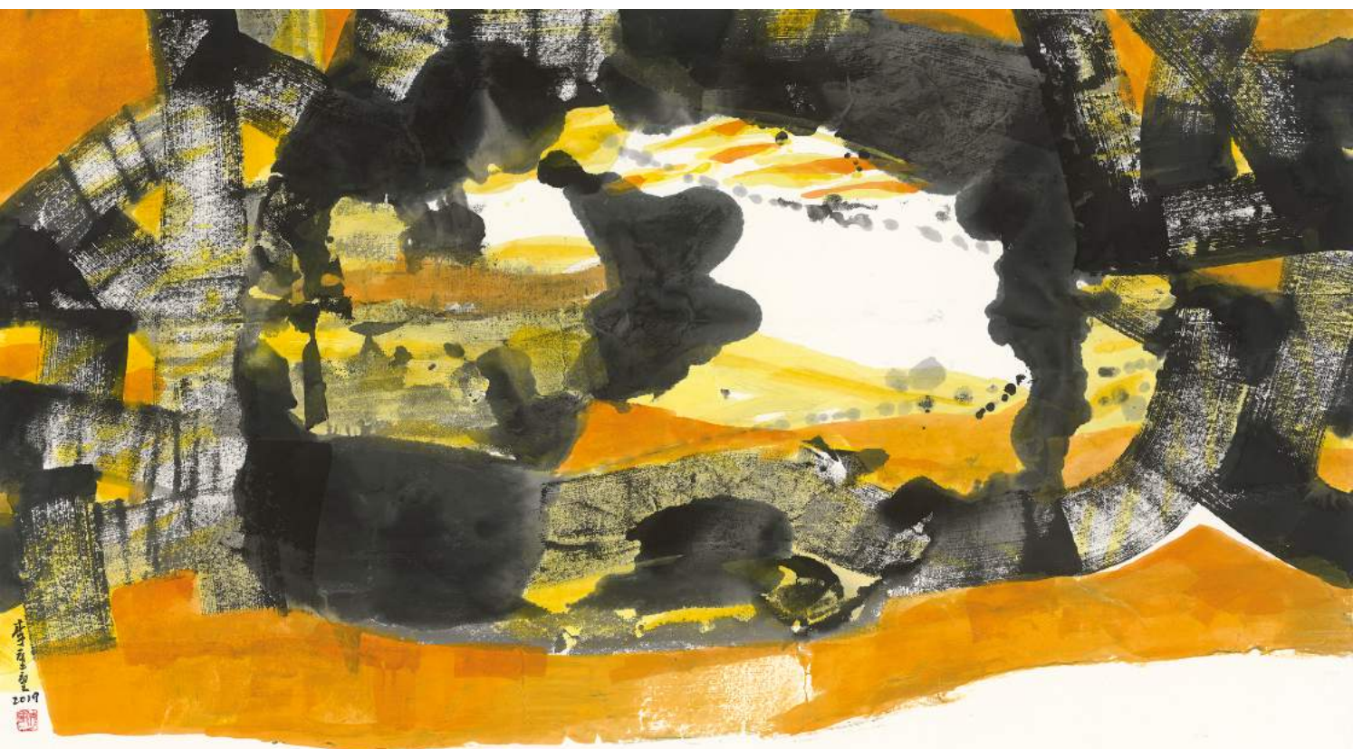
LEE Chung-Chung Poetry as a Brocade, 2019 Ink and color on paper 94×124.2cm 120×161.5×6cm (with frame)