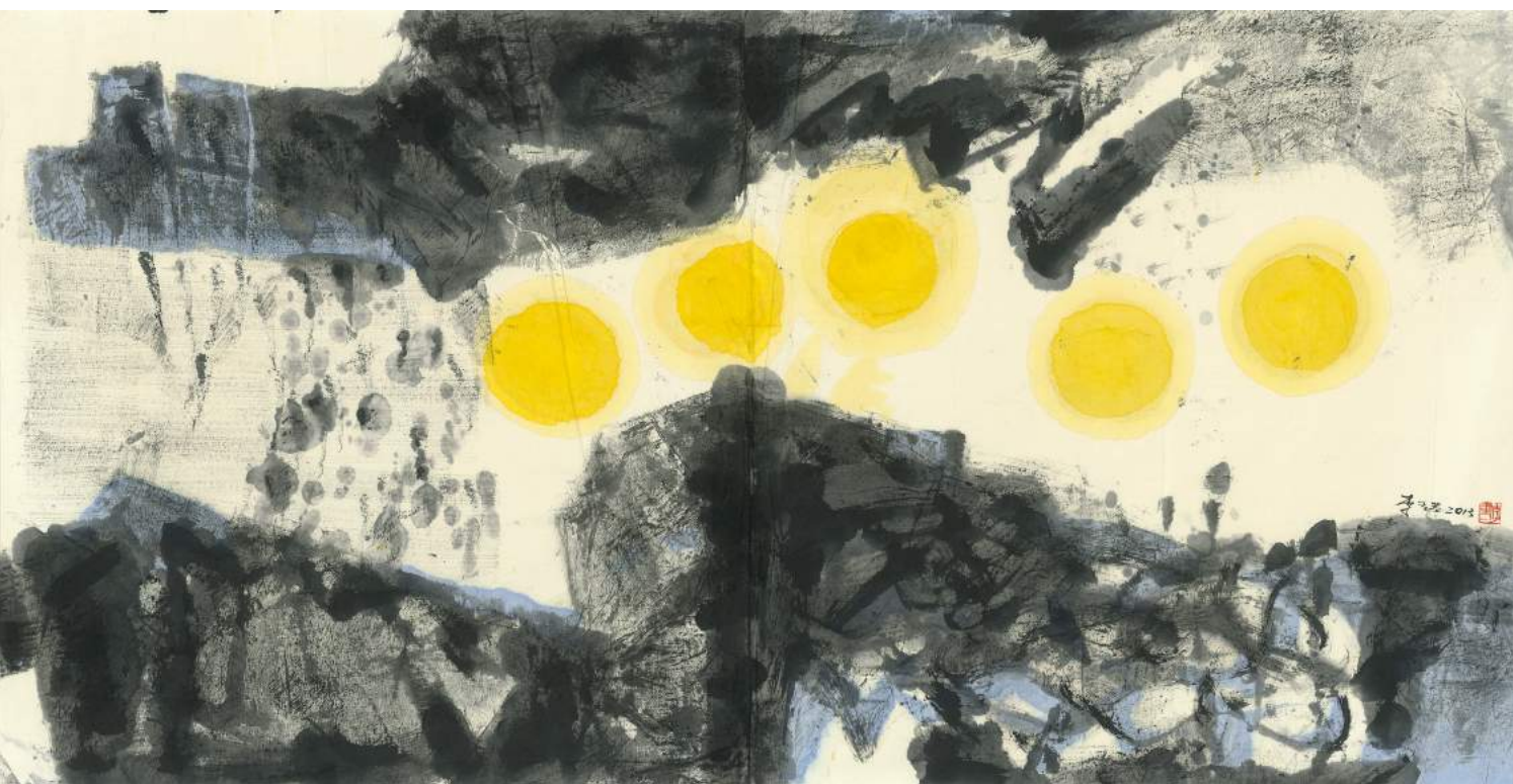
LEE Chung-Chung River of Life 3, 2013 Ink and color on paper 69.5×136.3cm 69.5×136.3×2.3cm (with mounting board)