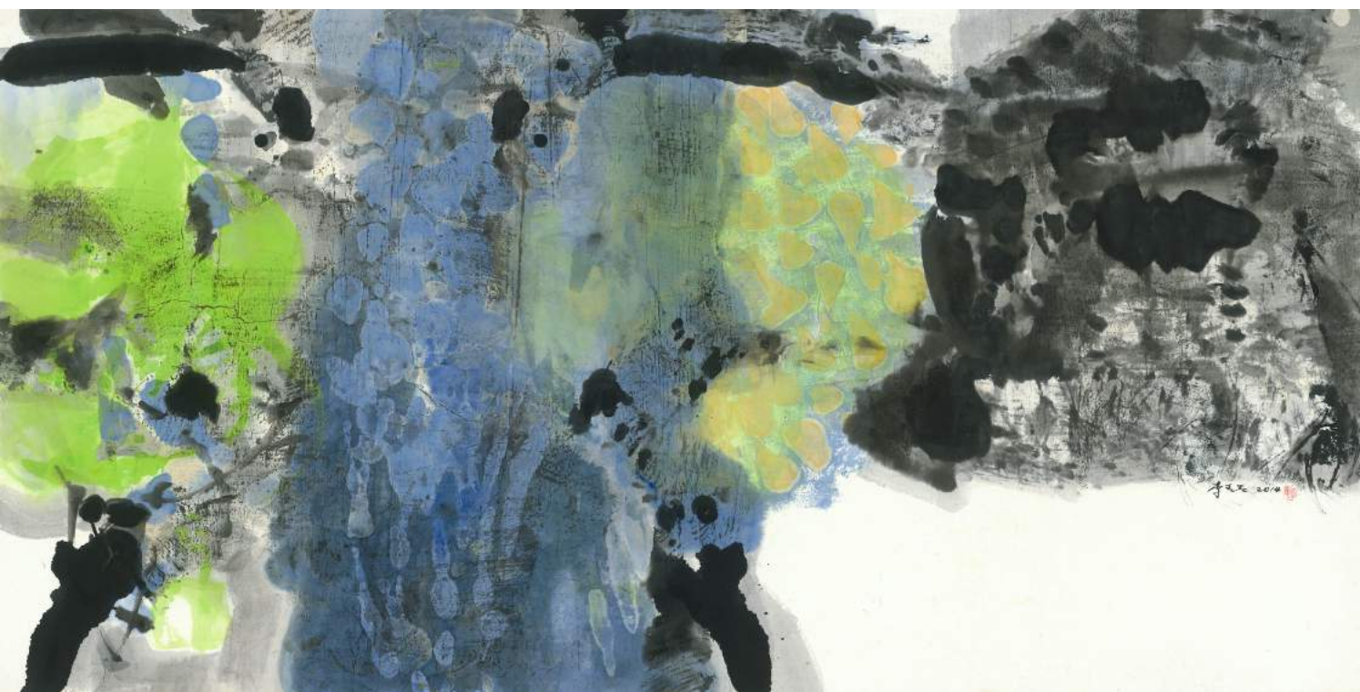
LEE Chung-Chung Riverside of Qin-huai, 2014 Ink and color on paper 69.6×137cm 93.5×172.6×5.5cm (with frame)